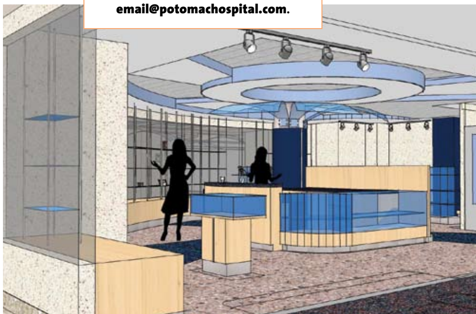
Artist's rendering of the new and improved Auxiliary-operated Gift Shop at Potomac Hospital.

For more information about the Auxiliary or for an application, please call 703-670-1539 or e-mail: email@potomachospital.com .